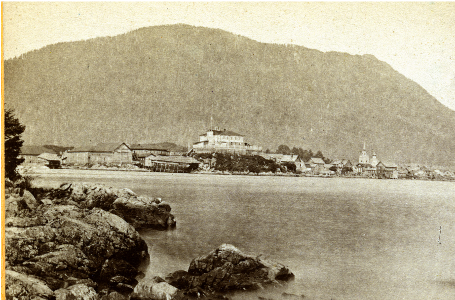
Sitka from Japonski Island, with the Governor's House - called Baranof's Castle by the Americans - in the center.

In 1867, Russia and the United States made a deal: the United States would pay Russia 7.2 million dollars, and the United States would get everything that Russia claimed in North America. “Russian America” became “Alaska.”