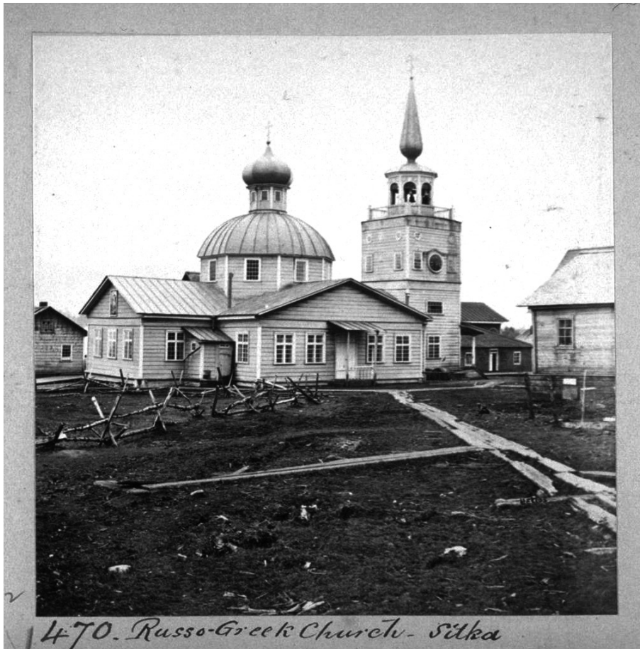
St. Michael's Cathedral, photograph made by Eadweard Muybridge in 1868. The church in Sitka now is a replica, completed in 1976.