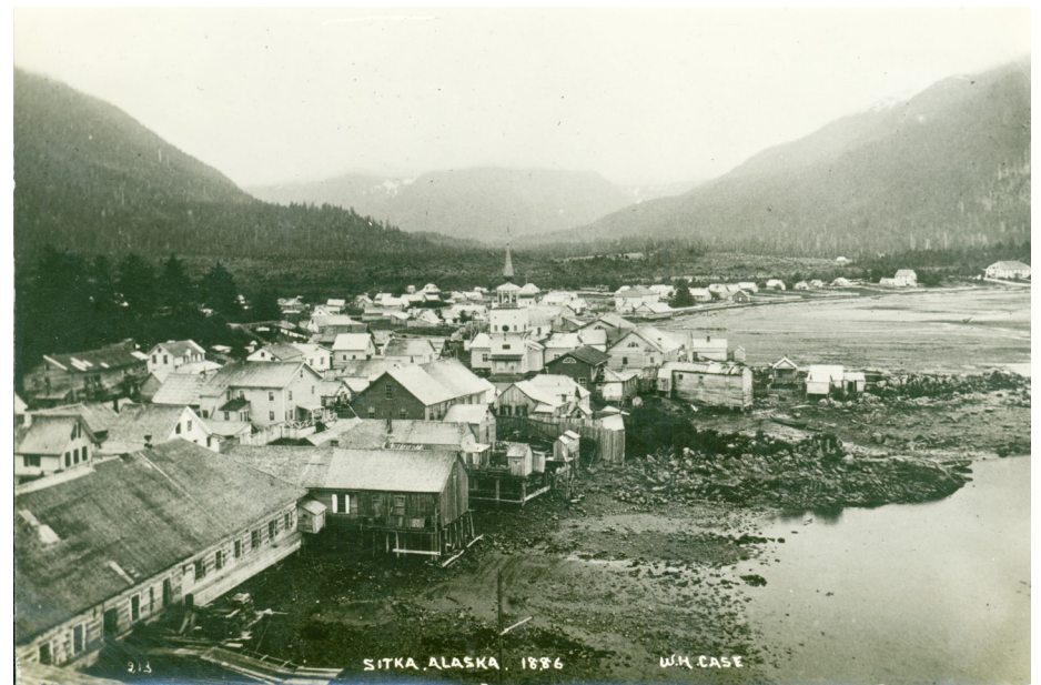
View of Sitka from Castle cupola in 1886.

What can people today learn from this history? One lesson might be to appreciate other cultures, and to treat people as individuals, instead of judging them based on things like their ethnicity or religion. People in Sitka have been living together for a long time and are good at living and working and playing together. Learning more about each other and