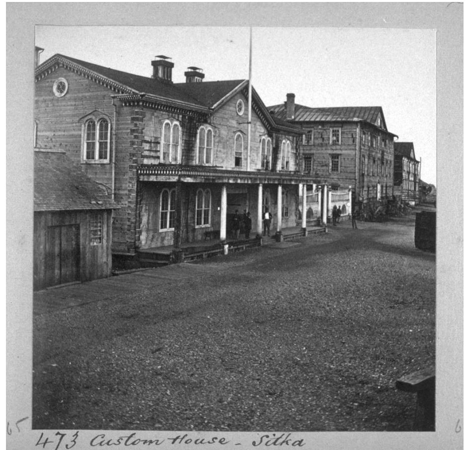
473 Custom House - Sitka

Indian Village Sitka from Japonski Island. Note the Civil War-style uniforms of the soldiers, standing on Japonski Island in this photo by Eadweard Muybridge in 1868. Presbyterian Historical Society, Sheldon Jackson Collection