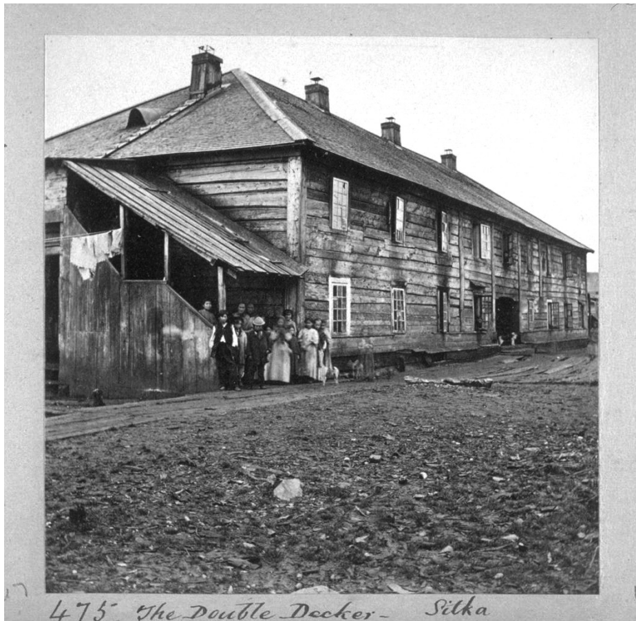
475 The Double Decker - Sitka The Double Decker by Eadweard Muybridge, 1868. Over 100 people were listed as living in this building in the 1870 census. Bancroft Library Lone Mountain College Collection

When Americans came to Sitka, they considered Tlingit people savages. Russians who stayed could become citizens, but Native people could not. Tlingit leaders protested that they still owned their land, but their claim was not recognized by the American authorities.