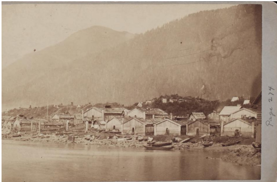
Sitka's Tlingit Village late 1870s

Tlingit traders traded with the Russians and also with the British in what is now Canada. The Tlingit traders traded for furs from other