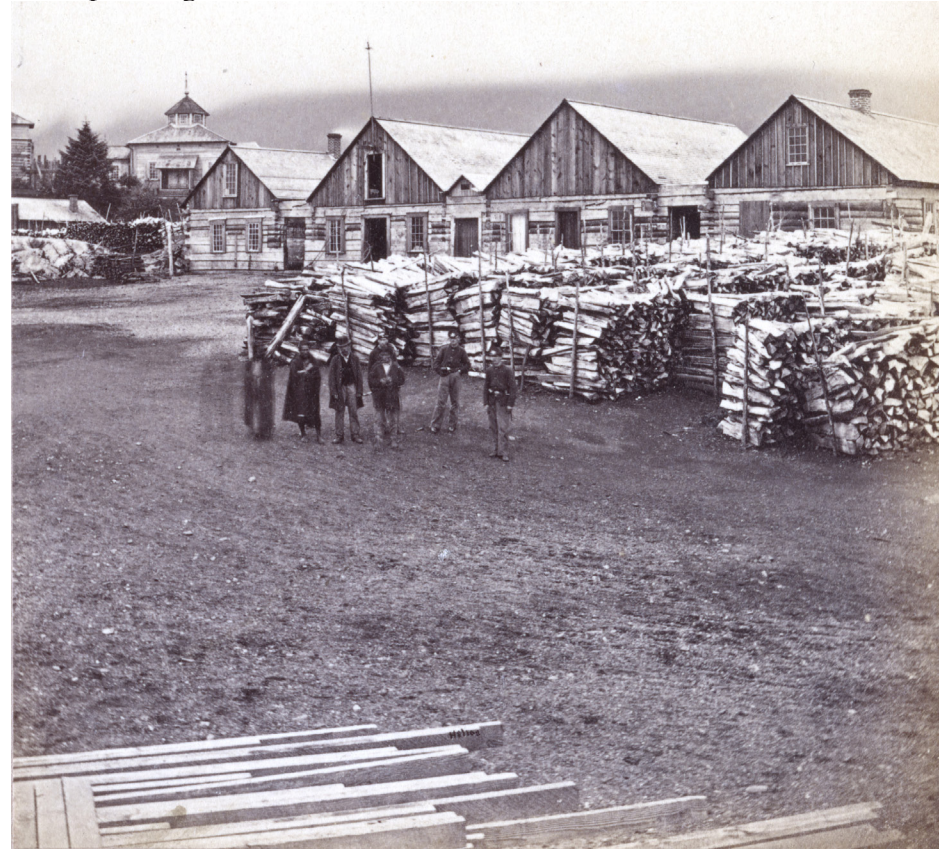
H.C.P. Parade Ground - Sitka

The Russians had to respect Tlingit leaders in order to stay in Sitka. In 1855, after a disagreement, Tlingit people attacked New Archangel, and several Russians were killed in the fighting. The Russians and Tlingit made peace again.