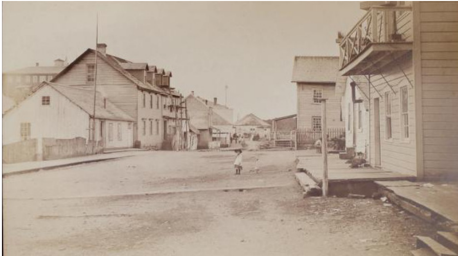
Sitka downtown 1870s

the rule of the Treasury Department, and revenue cutter ships were the only law enforcement. Then in 1879, the Sitka Kiks.ádi leader wanted compensation for the deaths of some men killed while working for a whaling company, but didn't get it. The non-Native people of Sitka said they were afraid he would attack them, and they asked for protection. A British Navy ship came, but soon the USS Jamestown arrived, and the Navy took over ruling Alaska until 1884.