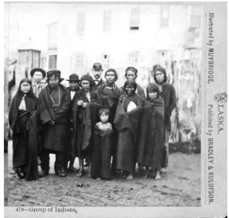
Photo of Tlingit people

The Russians had hundreds of Native hunters working for them, who traveled by kayak to southeastern Alaska all the way from Kodiak and beyond. The hunting voyages were very dangerous. Three years in a row, dozens of hunters died in accidents. In 1801 leaders of some of the crews