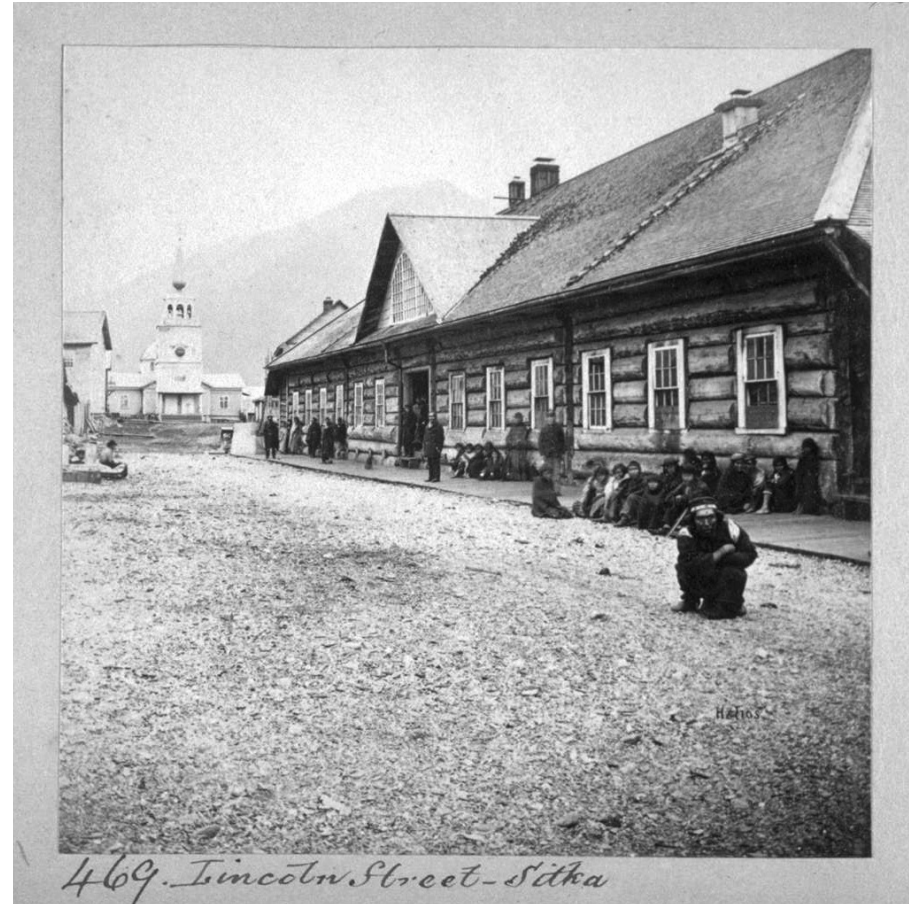
469. Lincoln Street - Sitka Lincoln Street, by Eadweard Muybridge, 1868

Around 900 people lived in New Archangel, which was the Russians' name for Sitka. Most of the people were born in Alaska, and most of them had Native heritage. The Russian American Company was a