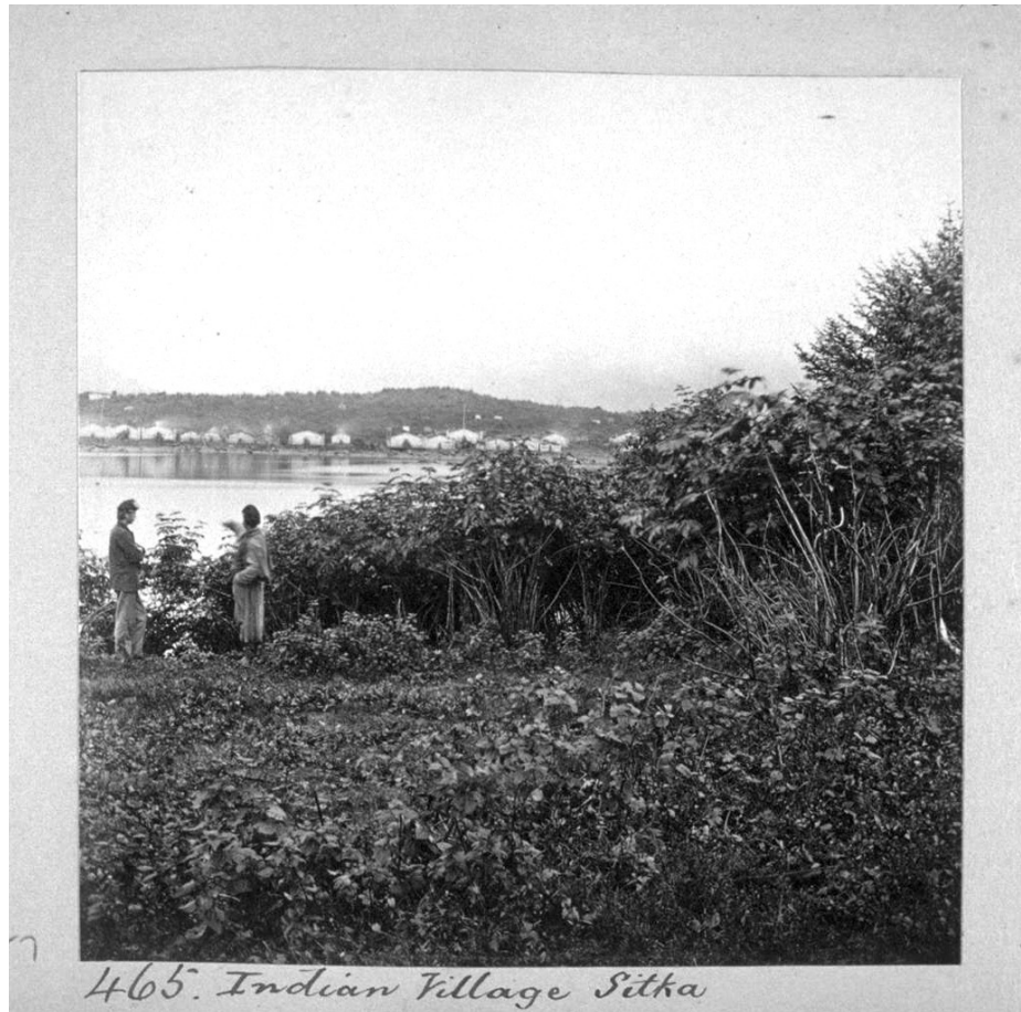
465. Indian Village Sitka

About 200 American soldiers were already at Sitka, waiting aboard a ship. They came on shore and went up the hill to line up in front of the